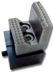
8-12100176 PA26 Turntable extensions for flangeless rims