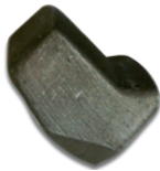
801254494 Set of 4 scratch protectors for alloy rims