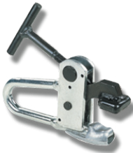
801227195 PL Alloy rim clamp