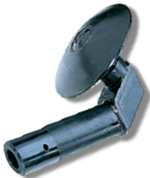
2016908 BBD Bead breaker disc