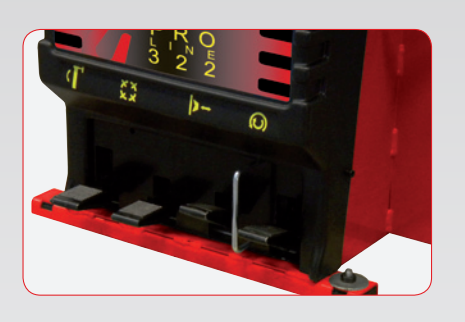
ERGONOMIC PEDALS made of aluminium.

for rapid positioning of the head in relation to the rim. Tool Head with interchangeable plastic parts to protect rims.