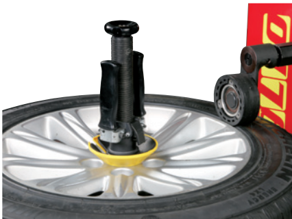
8-11100338 Pax system kit