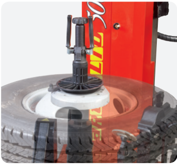
8-11100086 Pick-up rim kit