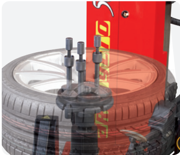
8-11100087 Universal flange for closed rims