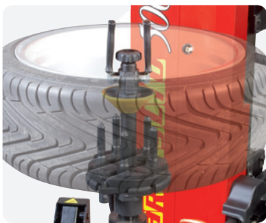
8-11100039 Reverse wheel flange